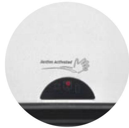
Sleek, stainless steel styling