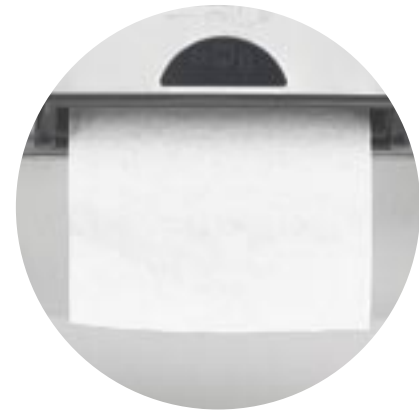
A simple wave of the hand activates touchless dispensing