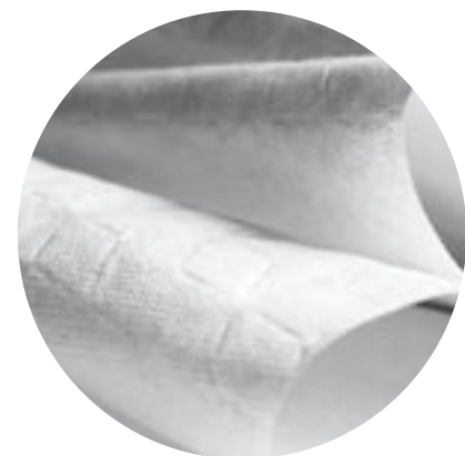
A choice of towels delivers comfort and performance